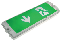
Use with legend