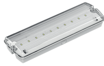
Use without legend